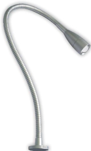
AquaLED Flexible chart light, color red, 1W, 12/24V DC Multivolt