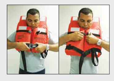
Step 3 Clip together both buckles of the lifejacket.