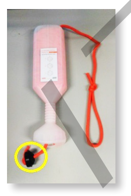
Step 2: Remove the plastic cap from the bottom of the plastic body.