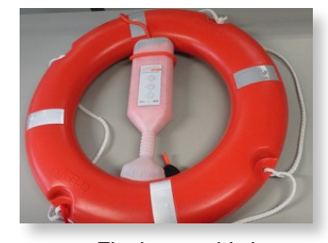
Step 8: Final assembly image (codes 72190 & 70090).