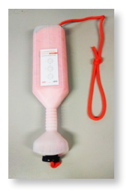
Step 1: Encapsulated Lifebuoy Rescue Line (code 72190).