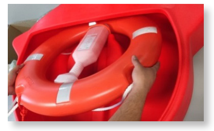
Step 9: Place the lifebuoy in the Ring Container.