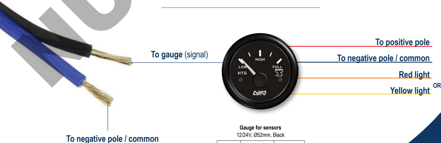
Gauge for sensors 12/24V, Ø52mm, Black