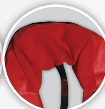
Soft Neoprene Material