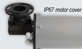
IP67 motor cover

Lofrans' designed marine anodised aluminium gearbox