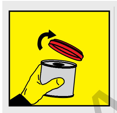
Step 1 Remove the plastic cap.